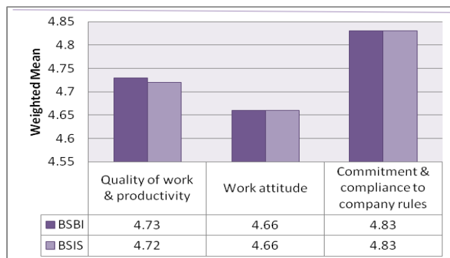
Figure 3. Employers' assessment on various attributes of BSBI/BSIS graduates

On the quality of work and productivity with a weighted mean of 4.73 for BSBI; 4.72 for BSIS; on work attitude, both were rated 4.66 as well as for the commitment and compliance to company rules with 4.83 (Figure 3) for both of the business graduates as employees.